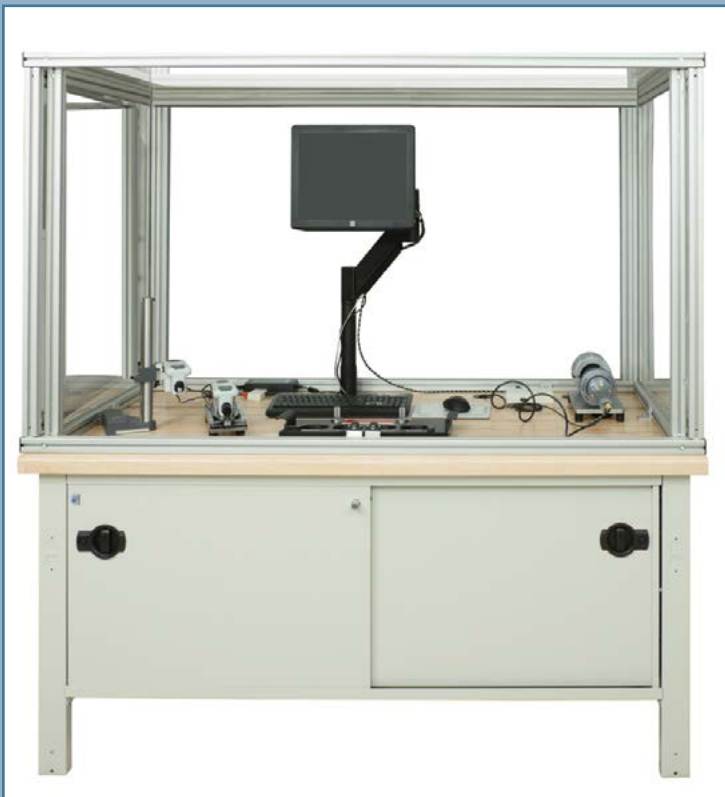
Surface Finish Cabinet