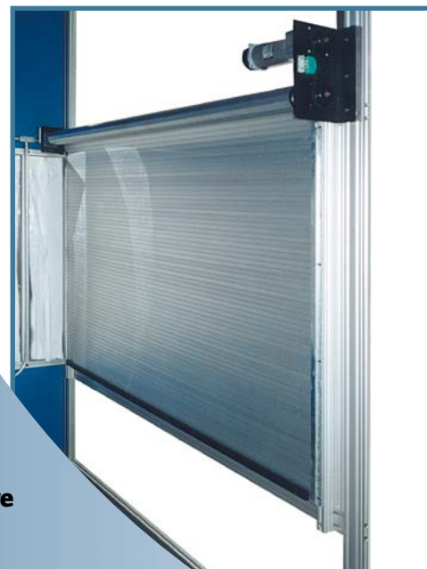
Electrical Aluminum Roll-up Door