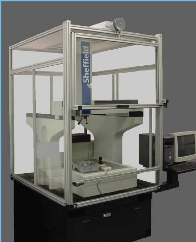
Base Mounted CMM Enclosure