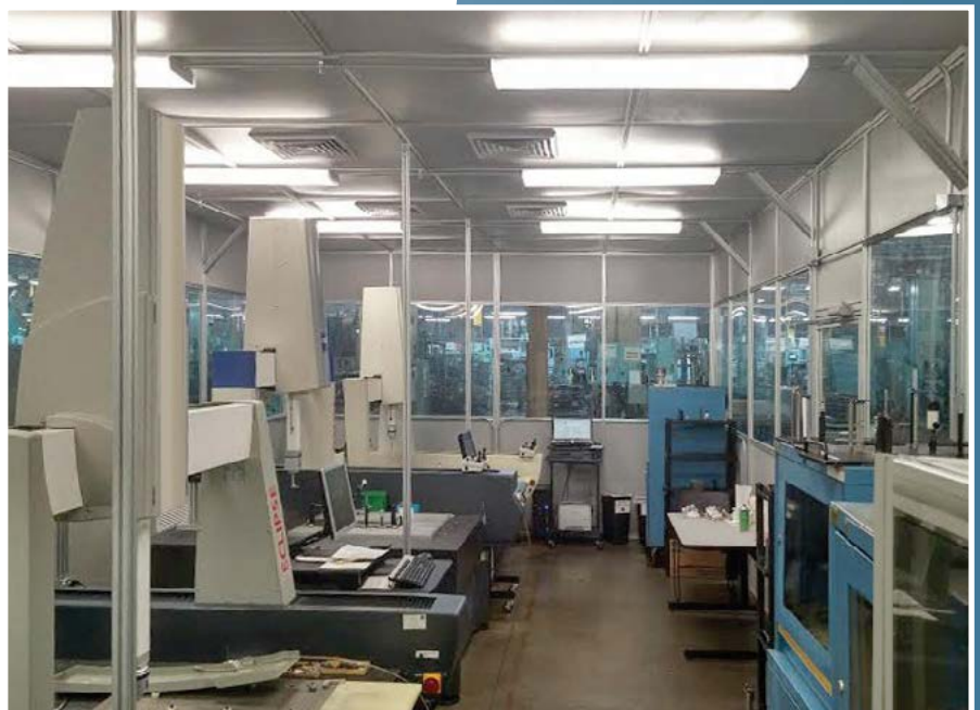
Temperature Controlled Enclosure