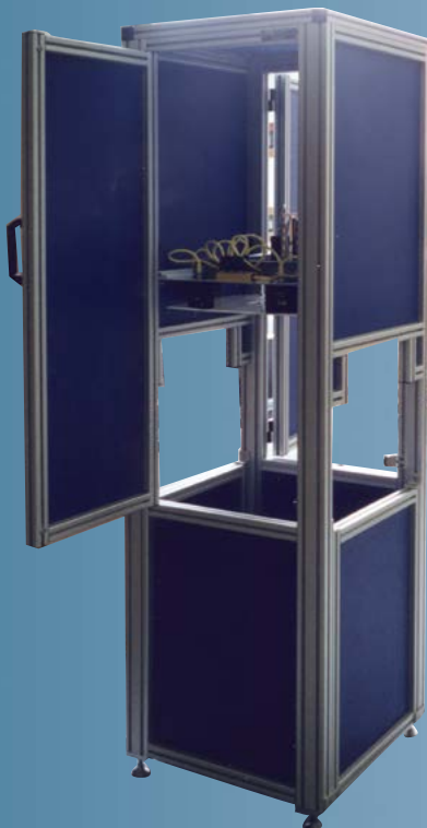
Inspection Camera Enclosure

C&C supplies clear or smoked gray Polycarbonate panels. Select from a variety of components for locking handles, hinges, and door plates.