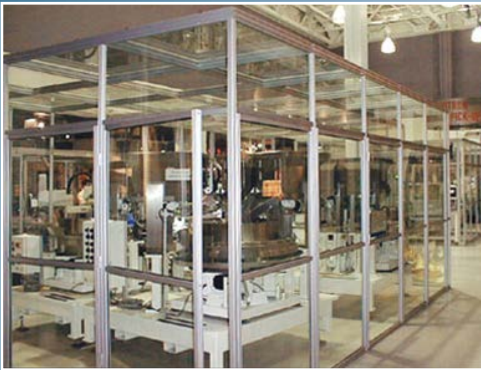
Polycarbonate Safety Enclosures